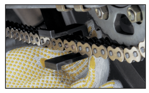
13a. Position the U-shaped holder as seen above.

13b. For clip type (FJ) install the open end of the clip so that it faces in the opposite direction of the chain drive direction.