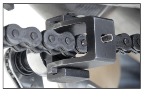
5a. Turn 19mm wrench clockwise on the tool's Hexagon bolt head to push the pin completely