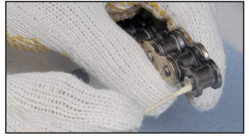
8a. Before installing the connecting link, be sure to put a heavy coat of the supplied grease into the holes of the bushings of the new chains' links, and on the surface of the connecting link's pins. If you are installing an O-Ring or X-Ring® chain, don't forget to put heavily greased O-Rings or X-Rings on the pins between the side-plates on both sides of the chain.