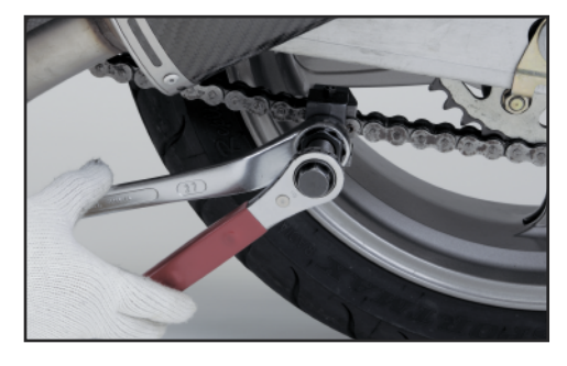
4a. Use a 27mm closed in wrench to hold firm the body of your chain tool while using a closed end 19mm wrench on the tool's hexagon bolt head to tighten. It will be easier to tighten the bolt if you position your wrenches 30° apart.