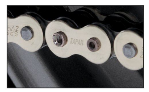
I 6a. Example of proper flared pin head. If your pin heads are not flared to this extent, Realign chain tool and flare pin heads until they look like the above photo. If your pin heads have cracks or the connecting link is stiff when flexed, remove connecting link and install a new one.