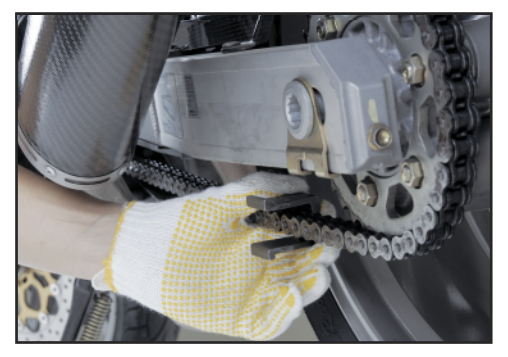
Ia. Before cutting your chain, loosen it using your motorcycle's rear wheel adjusters. Position your KM500R or KM501E over your chain on the bottom side of your swingarm; cut the pin on the right side of the link you choose first. If your chain has a master link, it is easier to cut the chain at the master link.