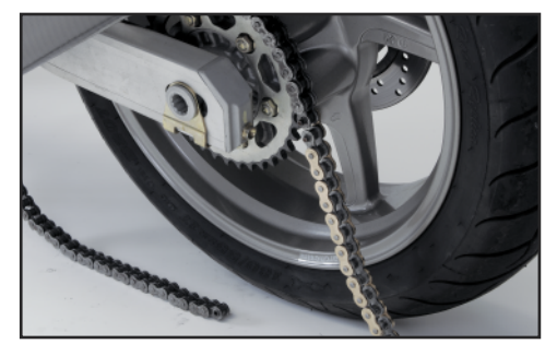
6a. After pushing the pin out, disassemble the chain tool from the chain.