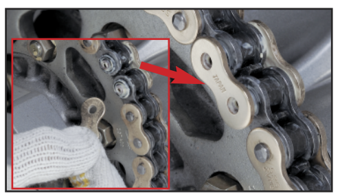
9a. With the inside of the connecting link pushed into place holding the chain together with the pins sticking out the outside of the chain, slide the O-Rings/X-Rings® into place and temporarily press the other side plate on the pins by hand. Set the Cutting pin location on your chain tool's U-shaped holder to the point A position.