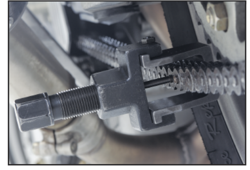
3a. To align the tool's Cutting pin with the chosen pin head, turn the tool's large bolt head clockwise "by hand" until the Cutting pin comes in contact with the pin head. At this point, make sure that the cutting pin is lined up with the center of the pin you wish to push out.