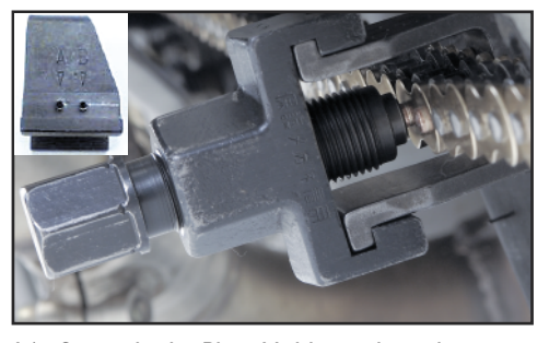
14a. Set aside the Plate Holder and set the pin on the tool body to the B position to flare out the pin heads.

13b. For clip type (FJ) install the open end of the clip so that it faces in the opposite direction of the chain drive direction.