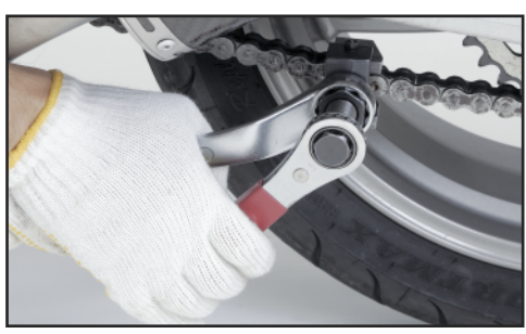
15a. Hold the hexagon part of the tool body by with a 27mm closed in wrench, and the bolt head with a 19mm closed end wrench; turn clockwise until the flare part of the pin head makes contact with the surface of the side plate.